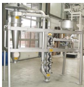
ZZ SEPARATOR SEPK12/120-2

Processing of dried vegetables. Removal of foreign substances such as hair, dust, paper, fibres