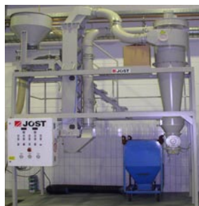
ZZ TEST SEPARATOR SEPK14/140-3

Processing of dried vegetables. Removal of foreign substances such as hair, dust, paper, fibres