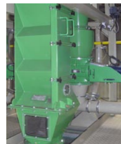
HYBRID SEPARATOR SEPHY10/120-2

Separation of PUR of crushed refrigerators