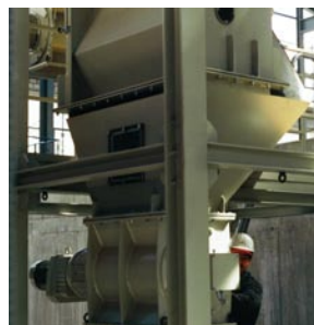
PARTIEL VIEW OF A ZZ- SEPK12/250-4

Separation of PUR of crushed refrigerators